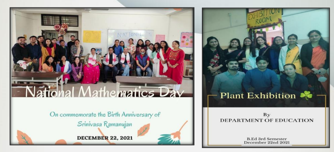
National Mathematics Day Celebration