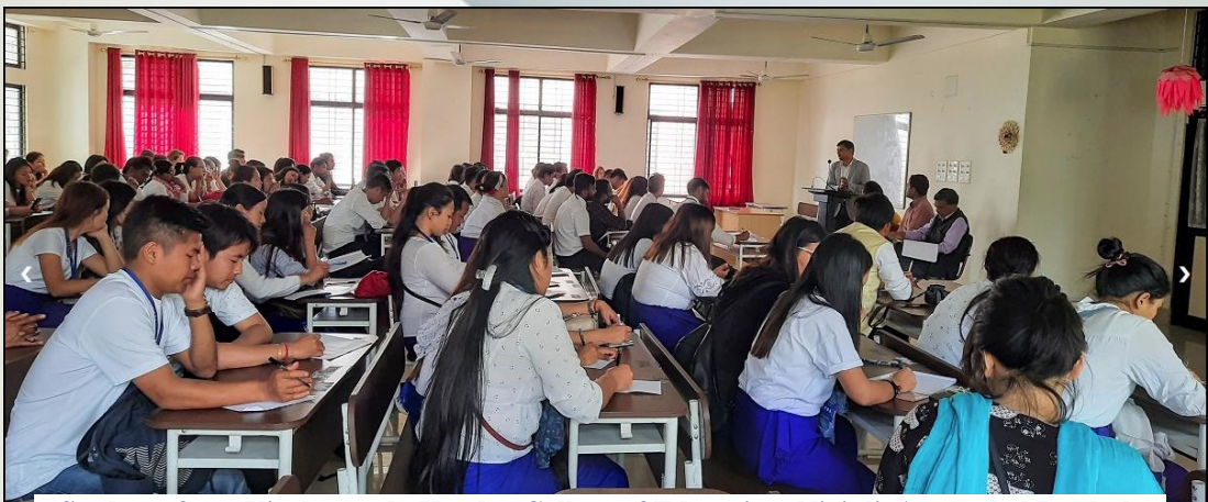
Students from Vivekananda Kendra College of Education, Nirjuli, Arunachal Pradesh visited Department of Education, Tezpur University as a part of their excursion.