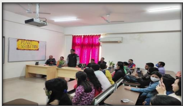
Inaugural Speech on Plant Exhibition Program