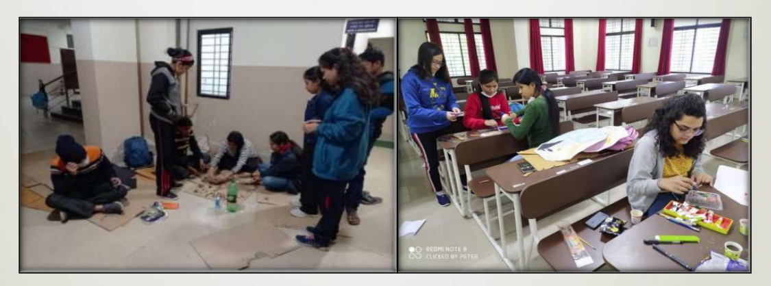
Wall Magazine Preparation